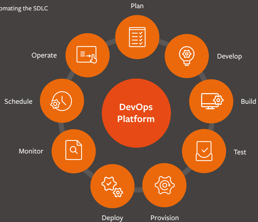
Figure 3. PayPal DevOps platform for automating the SDLC

To create an application, the developer clicks the Create Application button and selects an application framework to be used such as Java, node.js, Scala, or Python. The developer assigns a name to the application and specifies its parameters, such as: