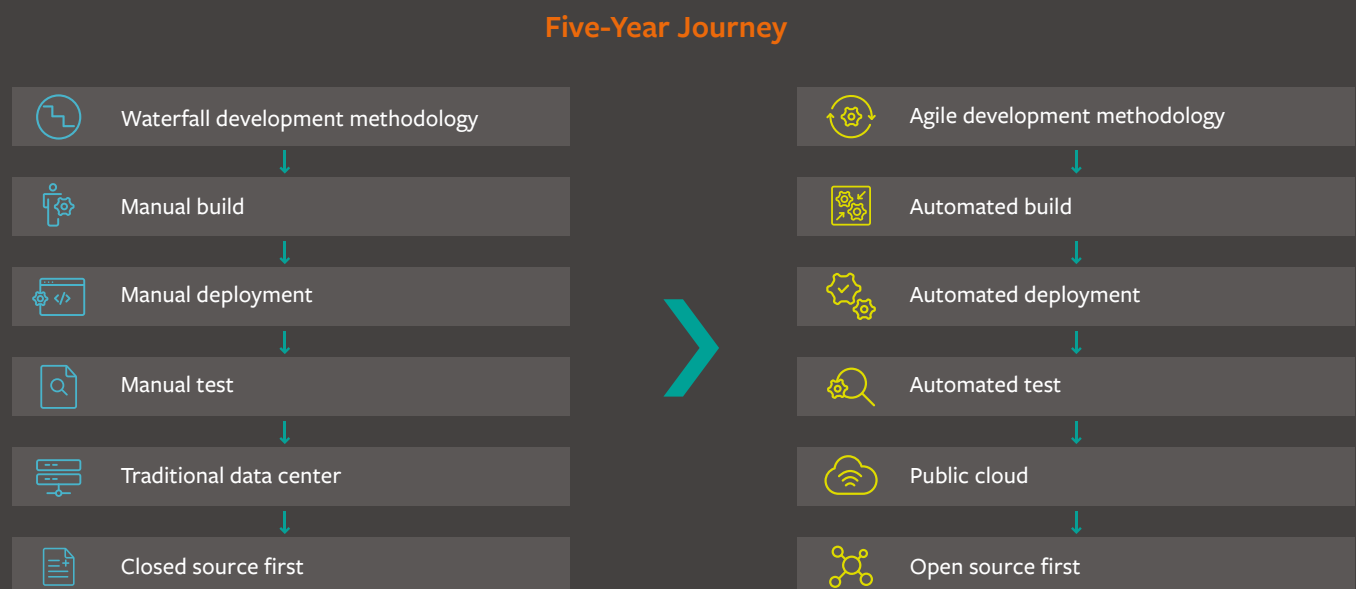
Figure 4. Five-year reengineering journey

The transformation involves completely reengineering the company's IT operating model over a five-year period. Figure 4 shows the changes that the reengineering will bring.