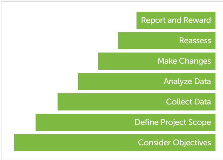
Figure 3: The Seven Steps to Highly Effective MIPS Management